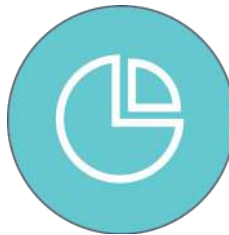
MARKETING STRATEGY GENERATION