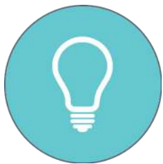
PRODUCT STRATEGY GENERATION