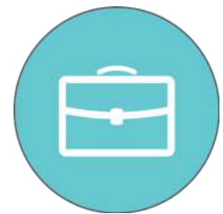
BUSINESS STRATEGY GENERATION