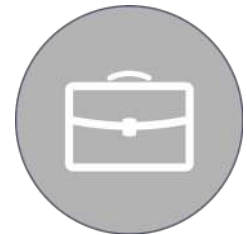
BUSINESS STRATEGY GENERATION